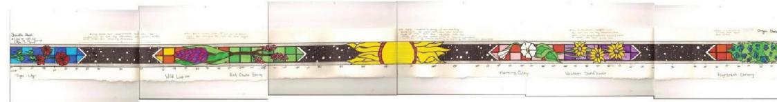
Figure 12, top. Aerial view of the pedestrian bridge participatory mural in Dayton, Ohio. ©Copyright 2012 UpDayton. Used with permission. Figure 13, middle. A scale drawing of the overall mural design for the pedestrian bridge project Figure 14, bottom. Participants painting the pedestrian bridge in Dayton, Ohio. ©Copyright 2012 UpDayton. Used with permission.