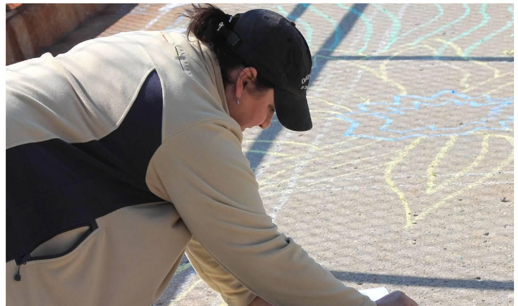
Figure 5. Chalking the outline for a participatory paint-by-numbers mural on the morning of the event.murals.

If you have to paint the outline on the same day that you're hosting the mural painting event (for instance, if you're working on a pedestrian bridge or in a parking lot that can only be closed for one day), have a team of artists arrive several hours before the first participants are scheduled to arrive, and have those artists start creating the outline based on the standard approach described previously in "Prep the Mural Site." The artists don't have to finish outlining and numbering the mural before participants arrive, but you do want to give the artists a comfortable head start. Participants can add color to each part of the outline as soon as the artists finish each section. Figure 5 shows an artist doing day-of outlining for a participatory mural at a pedestrian bridge in Dayton, Ohio.