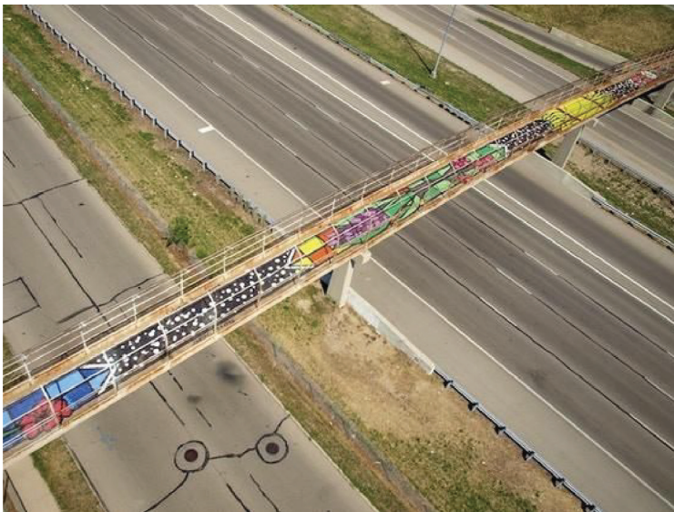
Figure 1. A paint-by-numbers community mural in Dayton, OH. Note the black lines (4") between color blocks.

With the generous support of the Rumphius Foundation and the Meetings for Environmentally Sustainable Agriculture (MESA) Project, Cruces Creatives is seeking proposals for a mural to be painted with community involvement on the west side of its building at 205 E Lohman Avenue, Las Cruces, NM 88001. So that community members of varying ages and artistic abilities can help paint the mural, the mural should be in a paint-by-numbers style. For an example, see Figure 1.