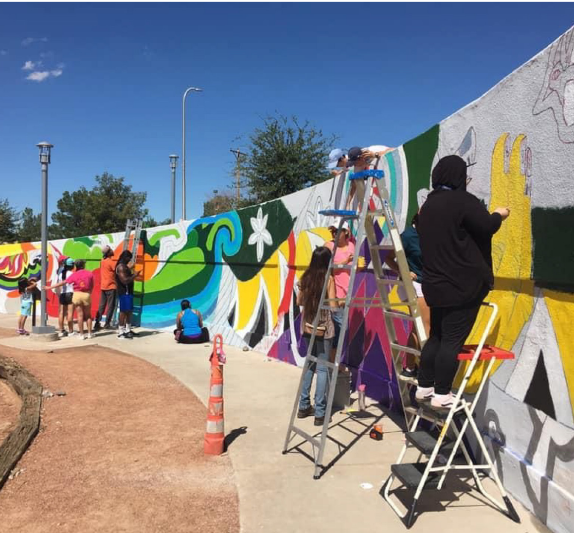
Figure 6. A participatory mural in progress at the Branigan Library in Las Cruces, New Mexico

As participants start to arrive, volunteers can give them an introduction to the event at the welcome table, then send the participants to the mural outline to choose a number/color they'd like to paint. Once participants choose a number/color, they can get a cup of that paint (labeled in permanent marker with the number) and a paint brush at the supply station. After participants are finished with their paint/number, they return the brushes to the Brush Washing Station for cleaning. Figure 6 gives an image of participants painting a mural in Las Cruces, New Mexico.