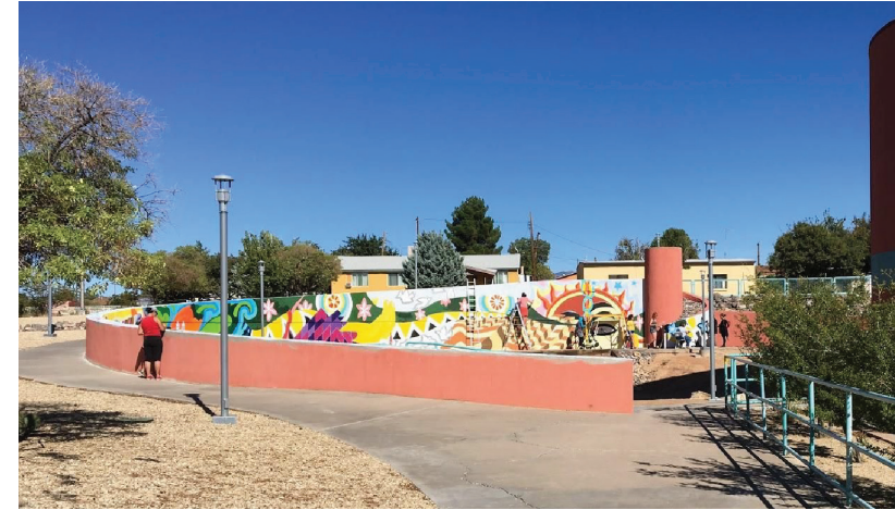
Figure 8, above. A participatory mural on the third day (and final) day of painting at Branigan Library in Las Cruces, New Mexico

This budget was funded through two grants, with $5,000 donated by the Rumphius Foundation and $1,000 provided through the MESA Project, funded by ArtPlace America.