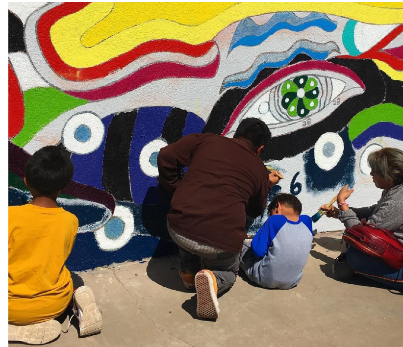
Figure 9, below. A family painting an area of “Tierra Sagrada,” the participatory mural at Branigan Library in Las Cruces, New Mexico