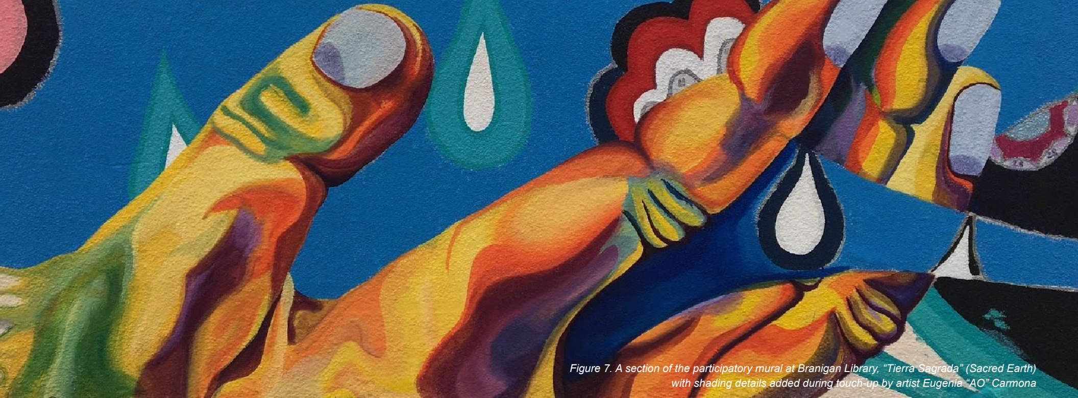
Figure 7. A section of the participatory mural at Branigan Library, "Tierra Sagrada" (Sacred Earth) with shading details added during touch-up by artist Eugenia "AO" Carmona