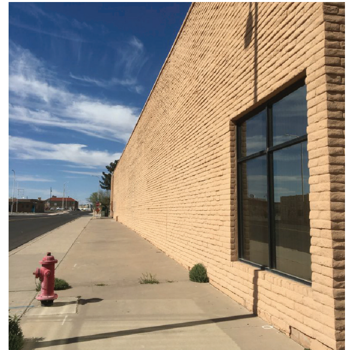
Figure 2. The wall available for the mural

The space available for the mural is an approximately 15' high by 200' long textured brick wall with a rough surface, shown in Figure 2. The mural design may use all or part of this space.