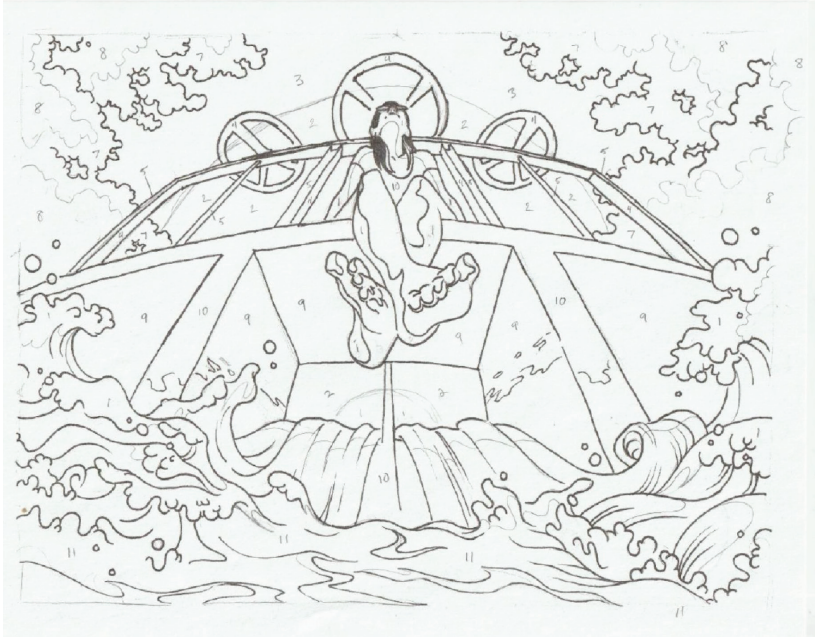
Figure 1. Draft Mural Outline for “By the Dam,” by Henry Hartig and Raquel Madrigal. ©Copyright 2019 Henry Hartig and Raquel Madrigal. Used with permission.

This booklet can help you organize a particularly accessible type of participatory public art, a paint-by-numbers mural, that people from all different backgrounds, ages, and artistic abilities can help create. Just like a paint-by-numbers coloring book, a paint-by-numbers mural is based on an outline drawing with color-coded numbers in each section of the outline. Figure 1 shows a mural outline designed in a paint-by-numbers style, Figure 2 shows the same design colored in, and Figure 3 shows the completed mural (modified from the initial drafts to include wildlife).