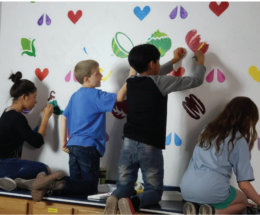
Figure 11, above. Children painting the break room participatory mural Figure 10, below. A stencil-based, participatory, paint-by numbers mural