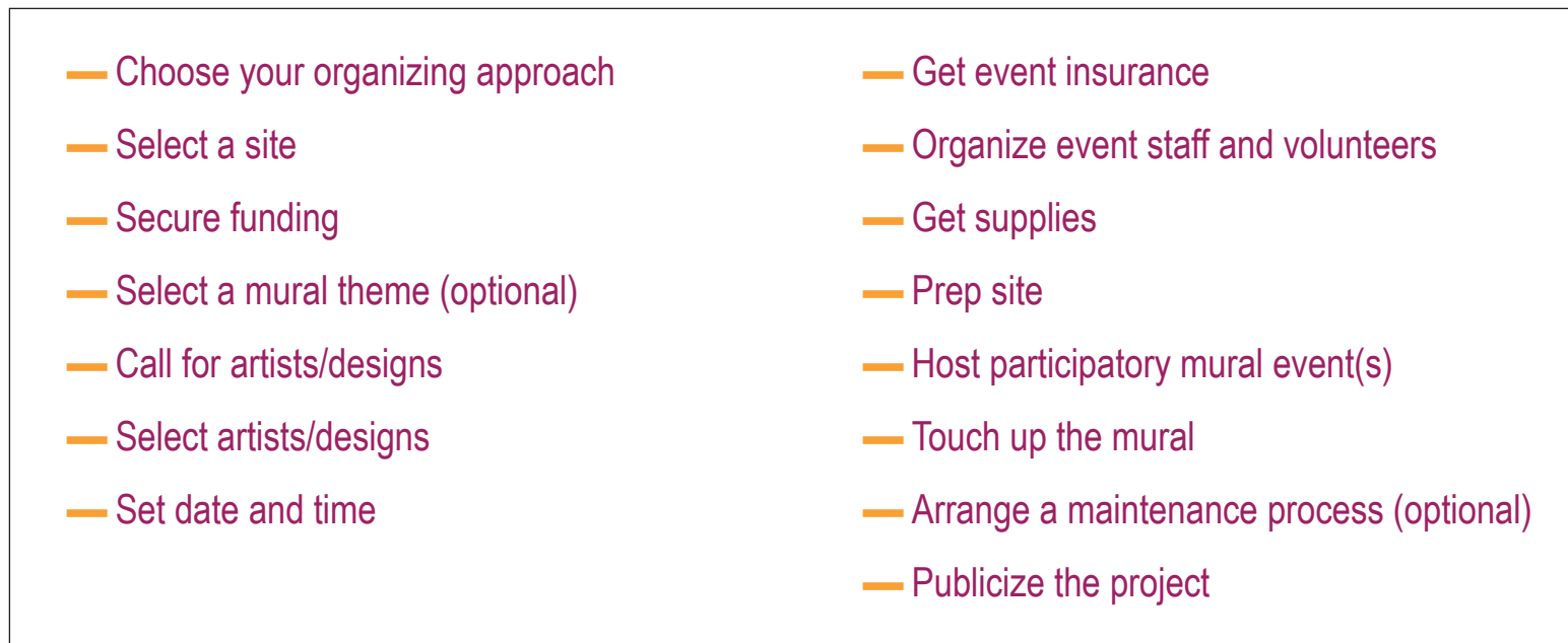
Figure 4. An overview of the tasks involved in organizing a participatory mural.

This booklet is designed to help you organize a participatory mural in your community. As you move forward, the process you use is likely to resemble the steps in Figure 4, which offers an overview of the general tasks involved in organizing a participatory mural.